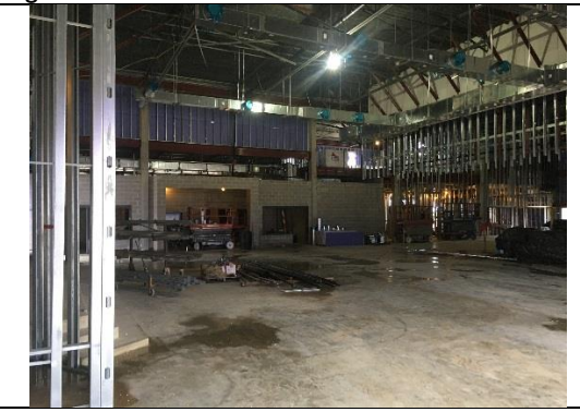
Cafeteria Dining Room interior work in progress.