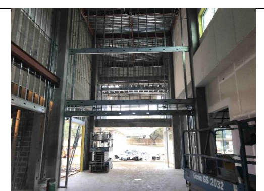
Main Entrance Security Vestibule