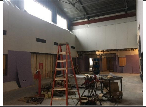
Moisture resistant gypsum board is being installed at areas that are already weathered-in.