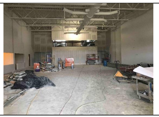
Library interior work in progress