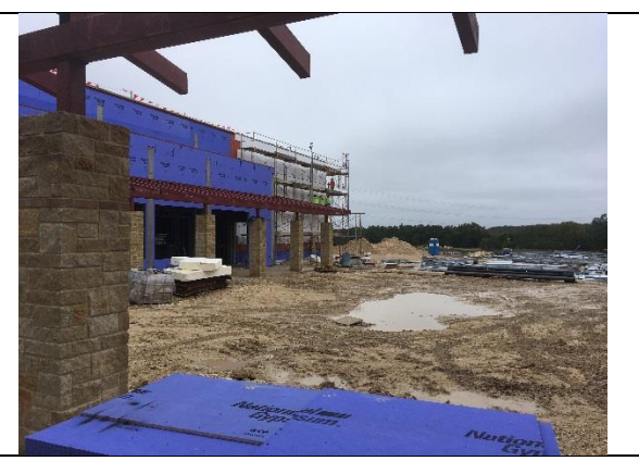
Courtyard View to the Gymnasium. Exterior wall sheathing and masonry columns