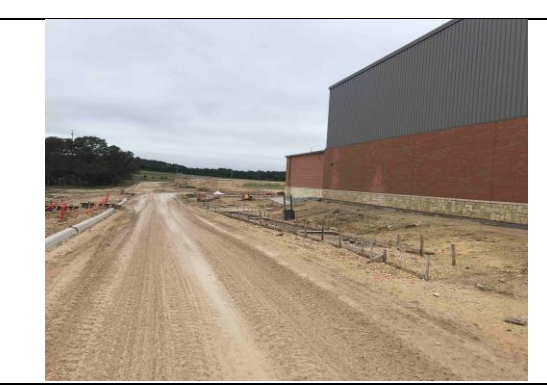
Site development - sidewalks, concrete curbs