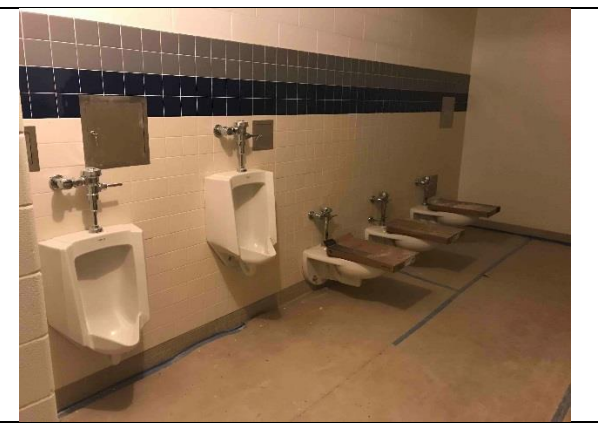
Restroom plumbing fixture installation