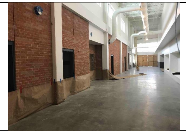
Gymnasium corridor with polished concrete floor