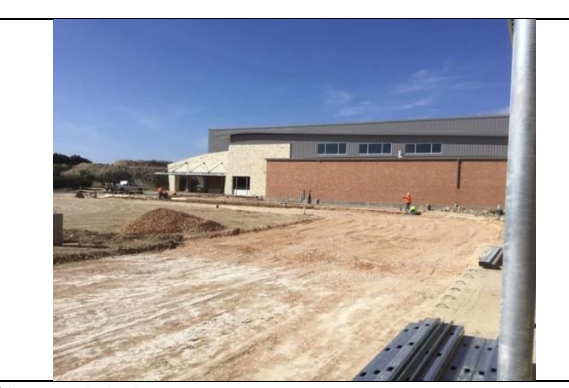
Site work is in progress