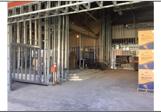
Steel stud framing at the Cafeteria Stage