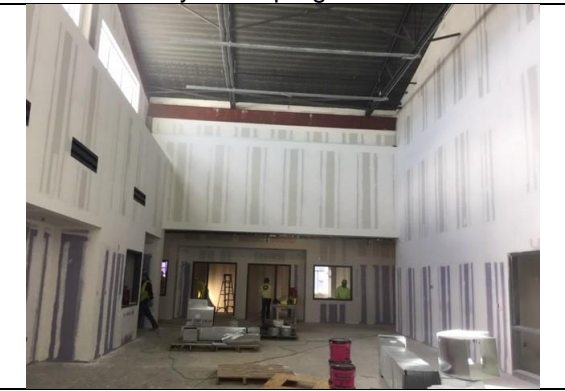
Taping and Float are in progress at the classrooms