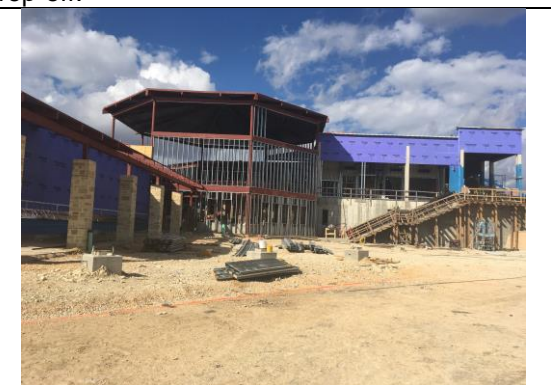
Structural Steel Installation at vertical circulation.