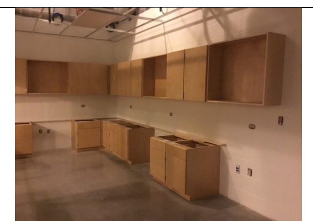
Millwork is being installed in humidity controlled spaces.