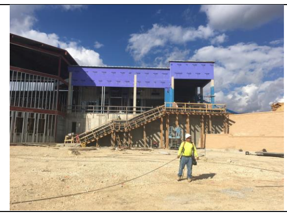
Bus drop-off view towards Administration and exterior stairs.