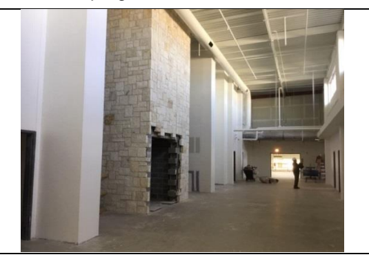
Elevator access at Administration level