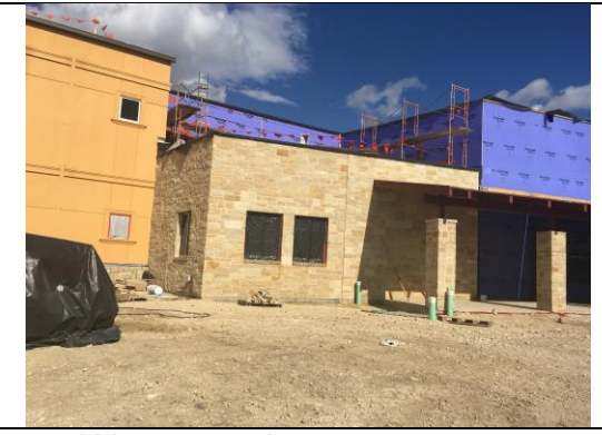
Stucco and Masonry are in progress.