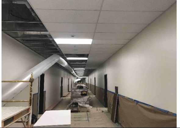
Classroom Corridor has humidity control. Suspended acoustical ceilings are being installed.