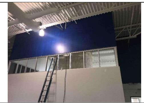
Library interior work in progress